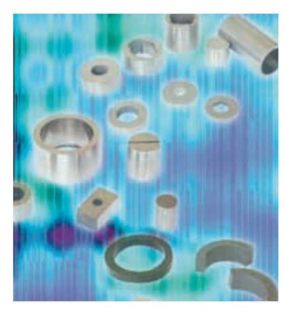
The magnetic product of China magnetic business