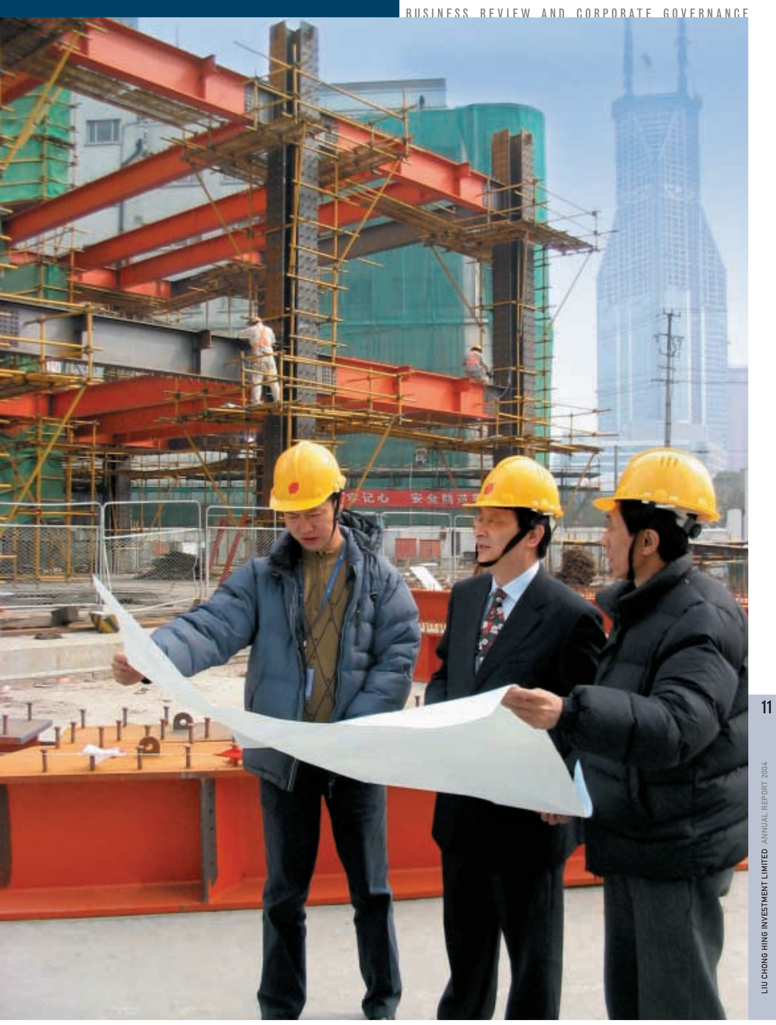
On site construction status