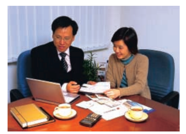
Insurance customer services

None of the directors proposed for re-election at the forthcoming annual general meeting has a service contract with the Company which is not terminable within one year without payment of compensation (other than statutory compensation).