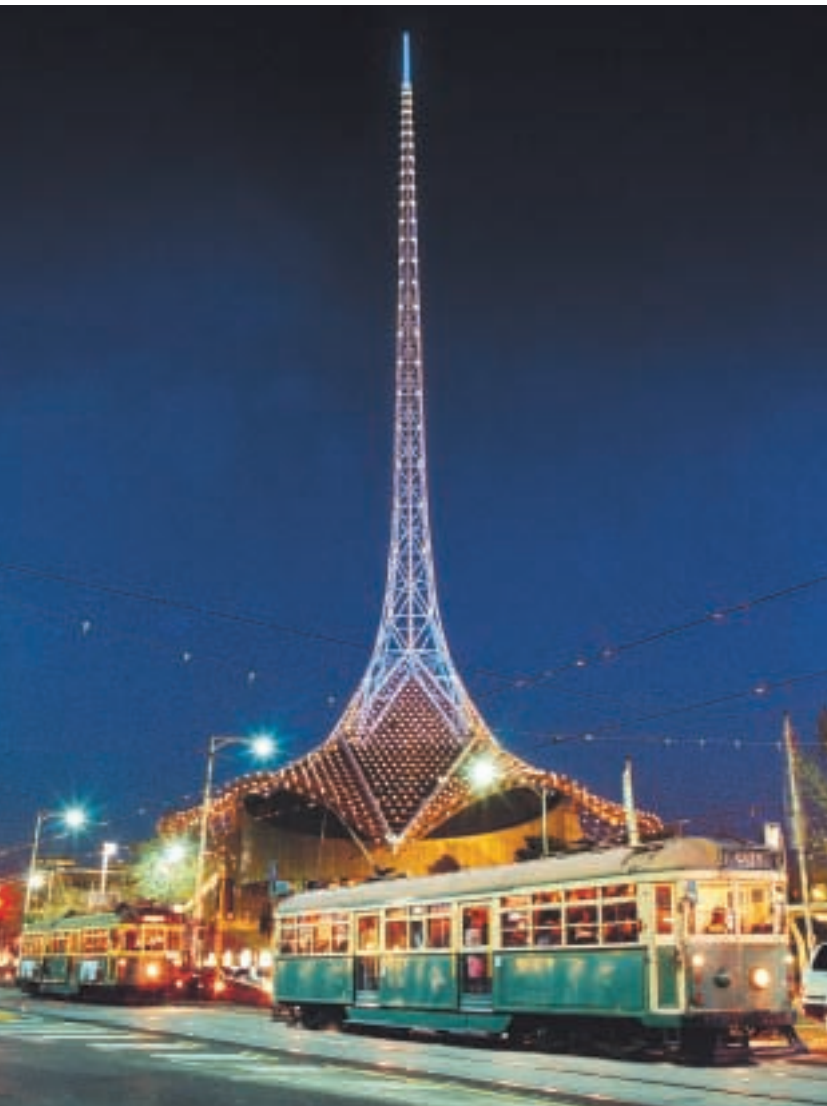
The glowing spire above Melbourne's Arts Centre reflects Australia's most dependable power distribution network – CitiPower.