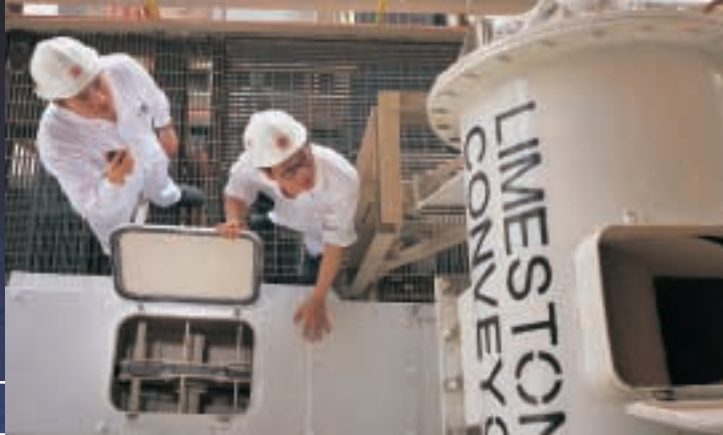
Hongkong Electric's flue gas desulphurisation plants reduce sulphur dioxide emissions to the environment.