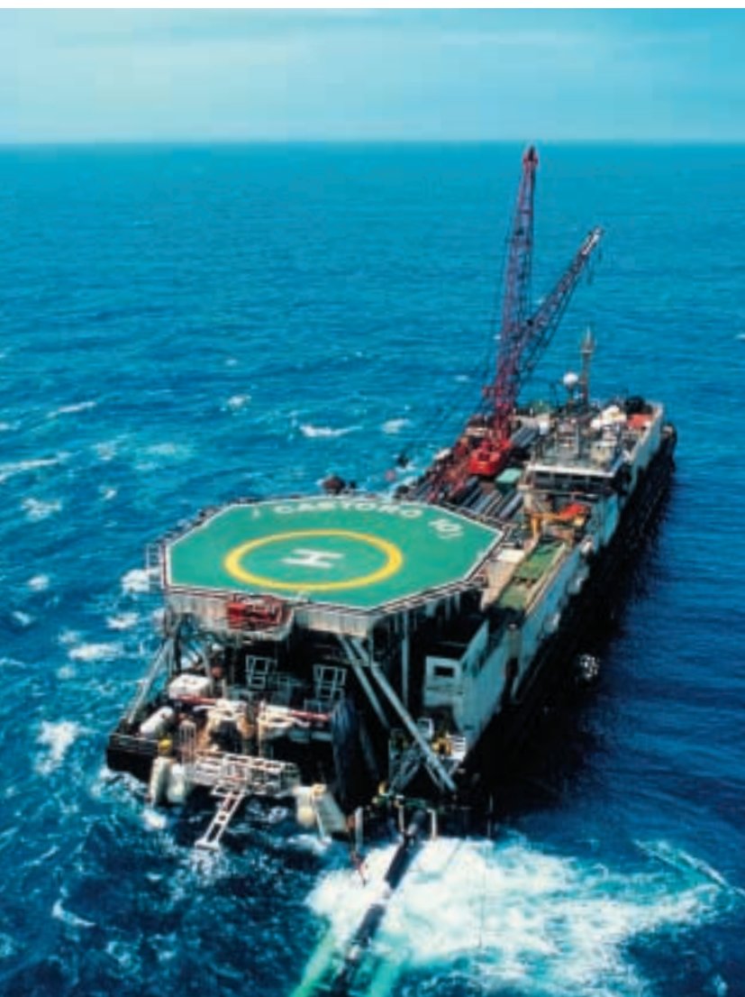
A barge lays a new Hongkong Electric pipeline to carry natural gas from Shenzhen to Lamma Island for future gas-fired turbines.

Hongkong Electric reported a net profit of HK$6,280 million in 2004, representing a growth of 3.7% over last year. This investment continued to be a major source of profit contribution for CKI.