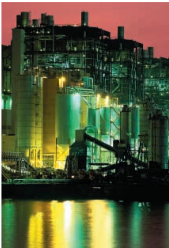
Lamma Power Station at night showing important environmental protection facilities: ash silos (foreground) and boilers fitted with low NOx burners (background).

During the year, Hongkong Electric has expanded into a new energy market – gas distribution in the United Kingdom – through the acquisition of a 19.9% stake in the North of England Gas Distribution Network. The transaction is due to be completed in mid-2005.