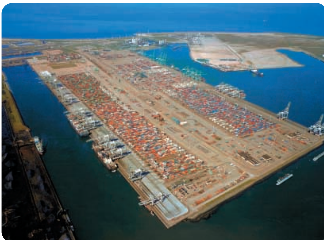
• A bird's eye view of ECT Delta Terminal in Rotterdam

In January this year, the Group acquired an 83.53% interest in Gdynia Container Terminal, a general cargo terminal in the Port of Gdynia, Poland, with a plan to develop it into a modern container terminal with three berths. The first phase of this development is scheduled for completion in the fourth quarter of 2005.