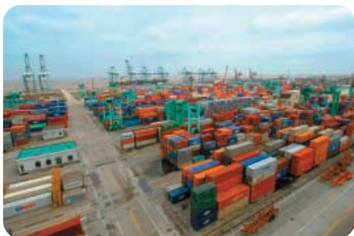
● Container yard view of Shanghai Pudong International Container Terminals.

In October, the Group entered into a 30-year concession agreement with the Port Authority of Thailand to develop six container terminals. The 16 berth facilities will be developed over a period to 2012.