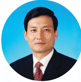
Xiao Yaqing Chairman and CEO