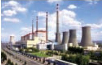
Zhang Jia Kou Power Plant