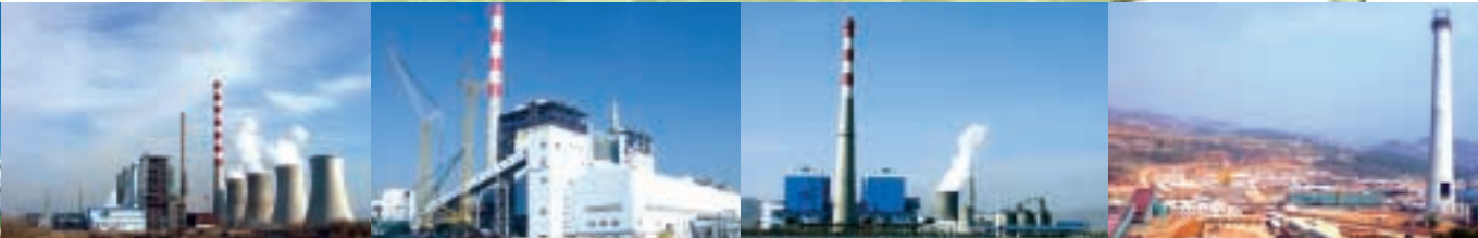
Shentou Power Company