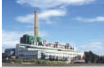
Xia Hua Yuan Power Plant