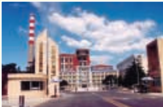
Gao Jing Thermal Power Plant