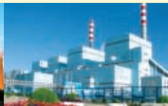
Tuoketuo Power Company