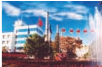
Dou He Power Plant