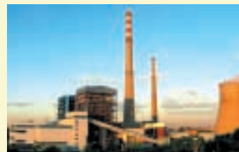
Tangshan Thermal Power Company