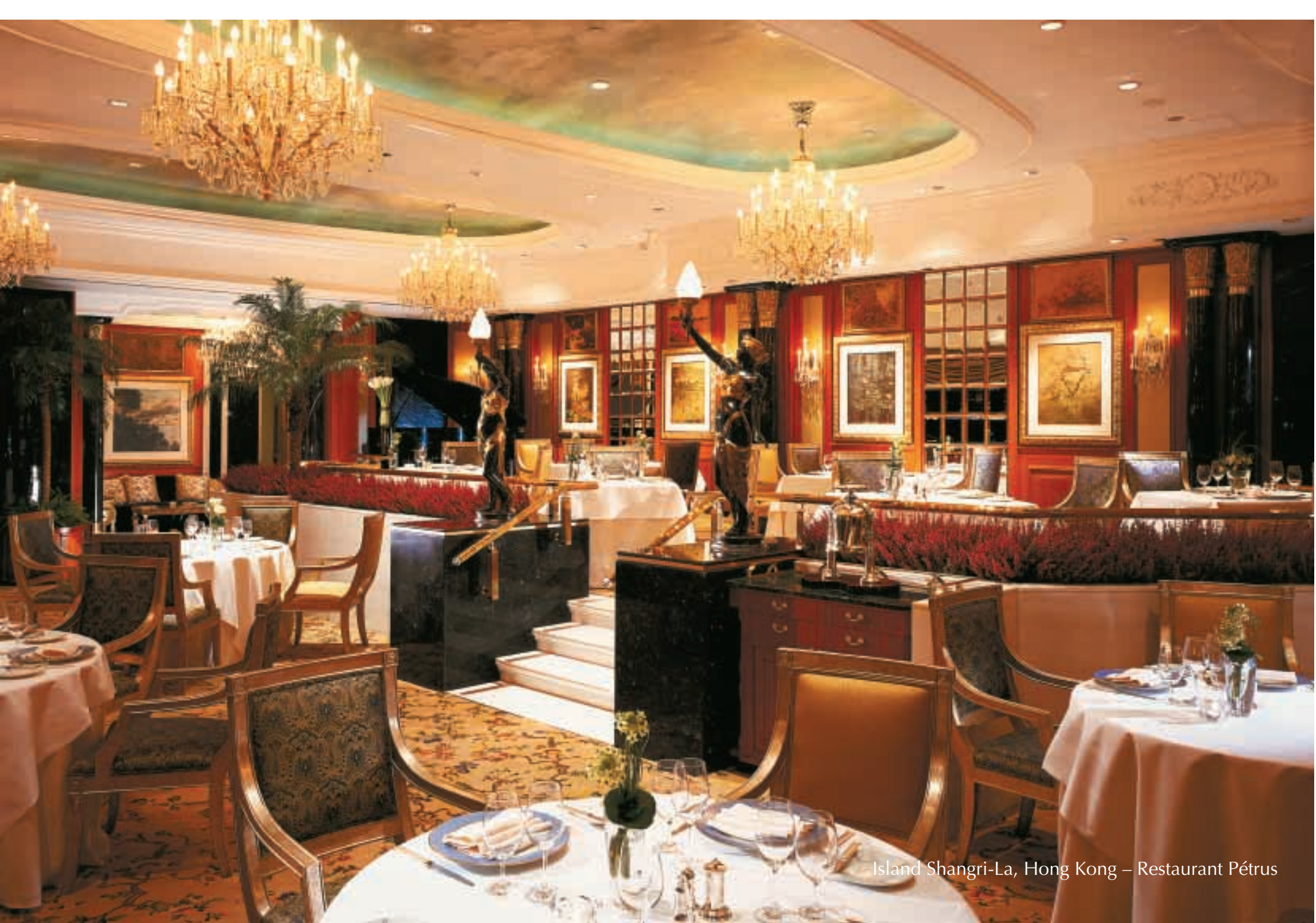
Island Shangri-La, Hong Kong – Restaurant Pétrus