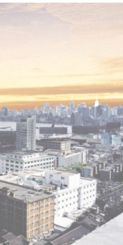
公司總部辦公大樓 Headquarters of the Company