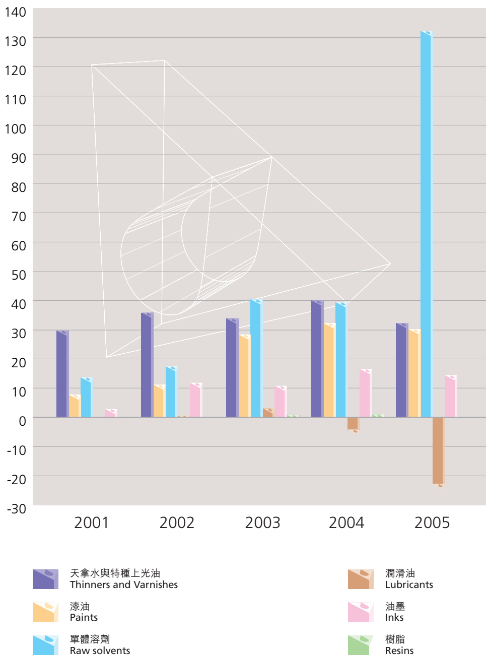
經營溢利 (百萬港元) Profit from operations (HK$ Million)