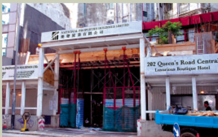
202 Queen's Road Central, Hong Kong under construction. 在建中的香港皇后大道中 202 號。