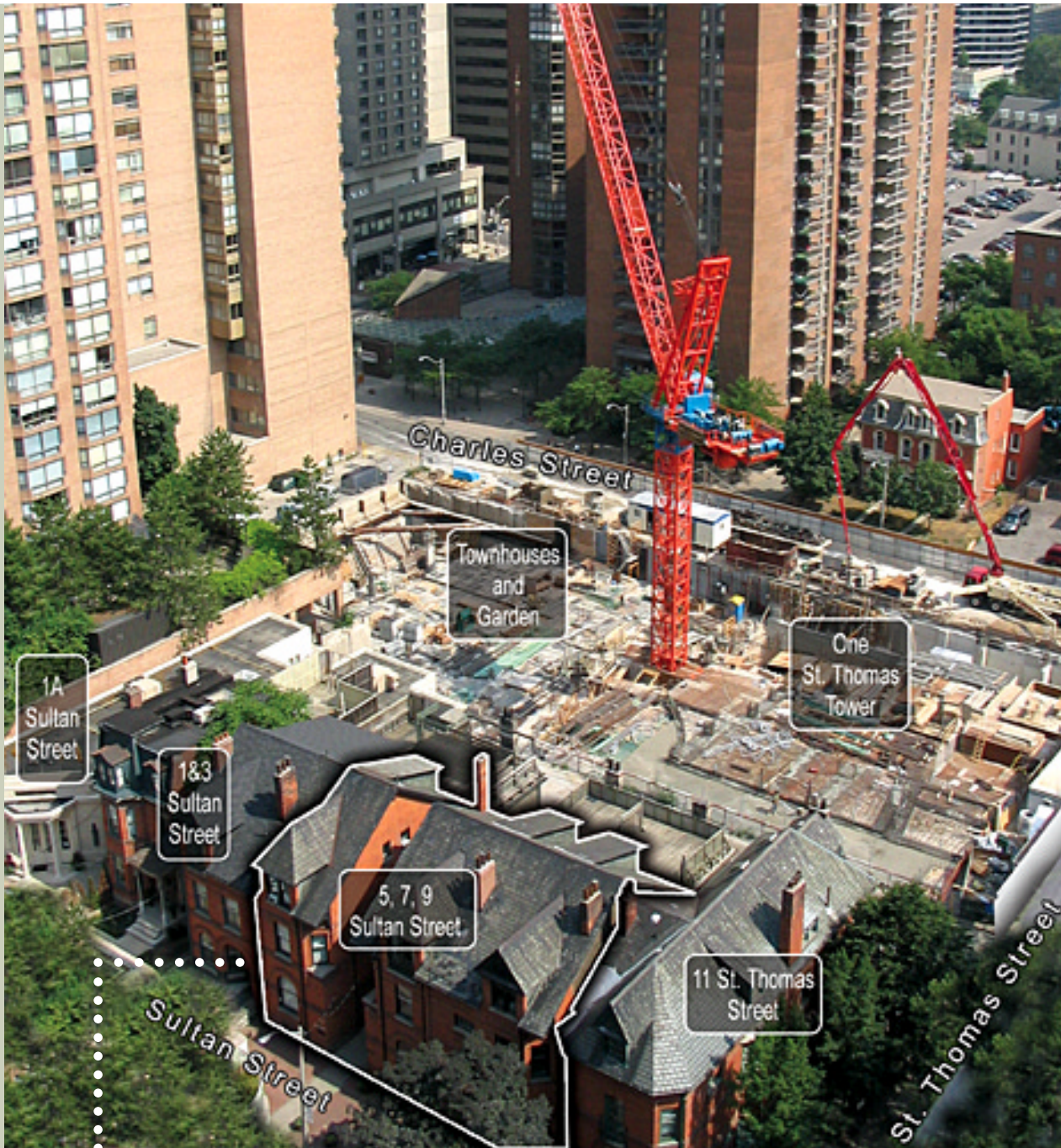
The Group's Toronto, Canada's Site fronting on three streets — Charles Street, St. Thomas Street and Sultan Street.