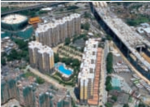
Office Tower II, The Grand Gateway

100% owned The Sherwood completed (New Territories)