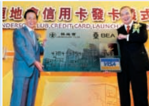
Henderson Club Establishment

HK$10 Billion Syndicated Loan Agreement Signed