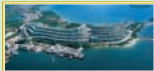
Tai Po Town Lot No. 161 sea view villas