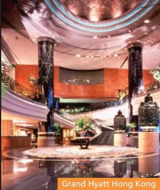
Grand Hyatt Hong Kong