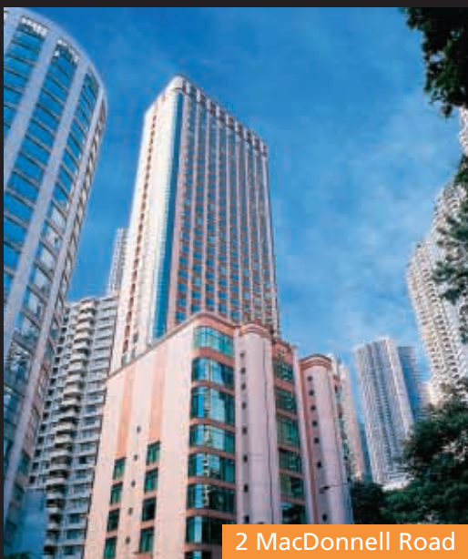
2 MacDonnell Road