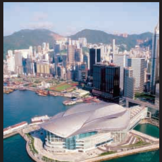
Hong Kong Convention and Exhibition Centre