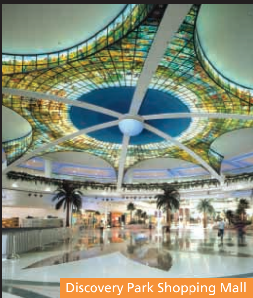
Discovery Park Shopping Mall