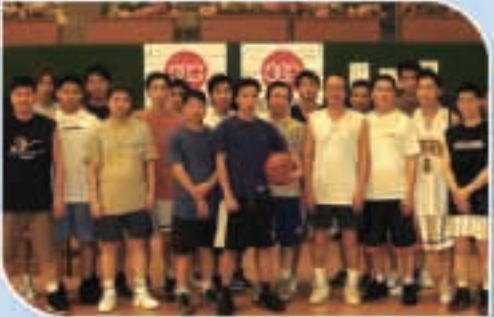
Group photo taken at the Inter-house Basketball Competition 2005 organised by the JCG Sports Club.

Staff and their family members posed at the entrance of Sunflower Farm during the Group Annual Outing to Panyu, China in November 2005.