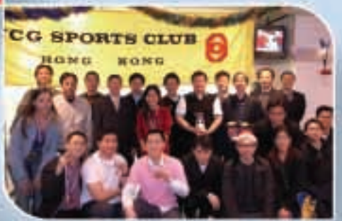
Winners of the 2005 Inter-house Bowling Competition organised by the JCG Sports Club.