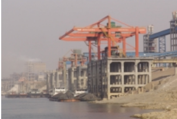
本集團位於廣西平南水泥生產基地的附設碼頭 The Group's pier attached to the cement production site at Pingnan, Guangxi

Coal prices have increased significantly since the second half of 2004 and remained steady at high level throughout 2005, resulting from increase in demand for coal and higher coal transportation costs in response to high oil prices and the government's effort to combat over-loading. On a year to year basis, the Group's coal purchase price increased by an average of approximately 28.5% during 2005. Coupled with other production cost increases, our cement production cost in respect of production lines existing at the beginning of 2005 increased by approximately 7.8% in 2005 compared with 2004. For the year ended 31 December 2005, total coal costs represented approximately 41% of our total cement production costs for our production plants with clinker production lines, an increase of 2 percentage points compared with that of 2004.