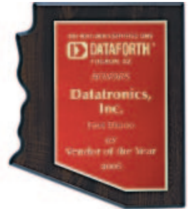
DATAFORTH Vendor of the Year