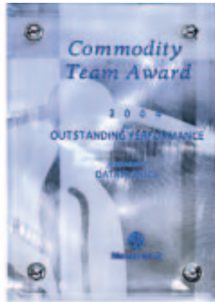
MEDTRONIC Outstanding Performance