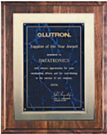
LUTRON Supplier of the Year