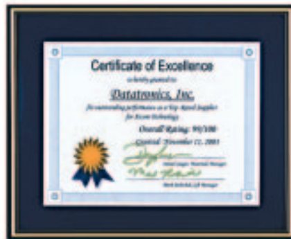
XICOM Outstanding Performance