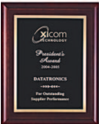
XICOM President's Award