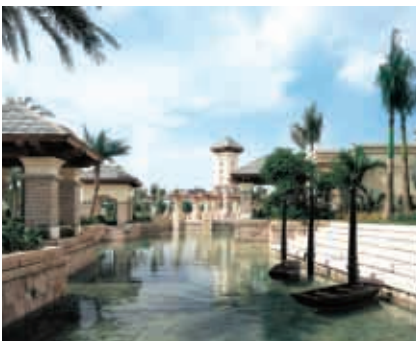
• Grand Garden

As of 31 December 2005, there were no properties under development or held for future development at Majestic Garden. The whole project was completed.