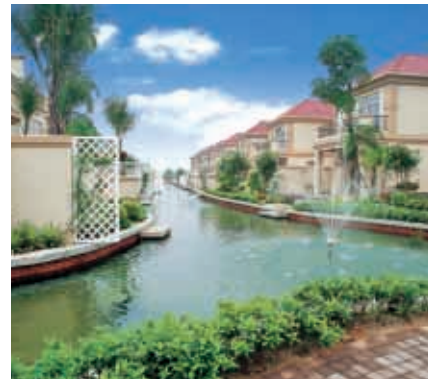
• Metro Agile Zhongshan

As of 31 December 2005, the properties held for future development had a site area of approximately 206,200 sq.m. with an expected GFA (including saleable and non-saleable) of approximately 354,000 sq.m. The whole project is expected to be completed by 2 nd quarter of 2009.