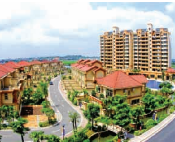
• The Riverside