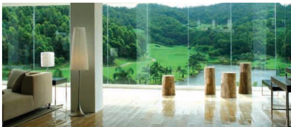
• La Cite Greenville

As of 31 December 2005, the properties held for future development had a site area of approximately 758,900 sq.m. with an expected GFA (including saleable and non-saleable) of approximately 1,203,700 sq.m. The whole project is expected to be completed by 4 th quarter of 2011.