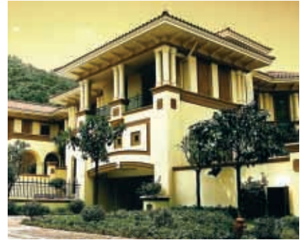
• La Nobleu

As of 31 December 2005, the properties held for future development had a site area of approximately 178,009 sq.m. with an expected GFA (including saleable and non-saleable) of approximately 117,526 sq.m. The whole project is expected to be completed by 2 nd quarter of 2009.