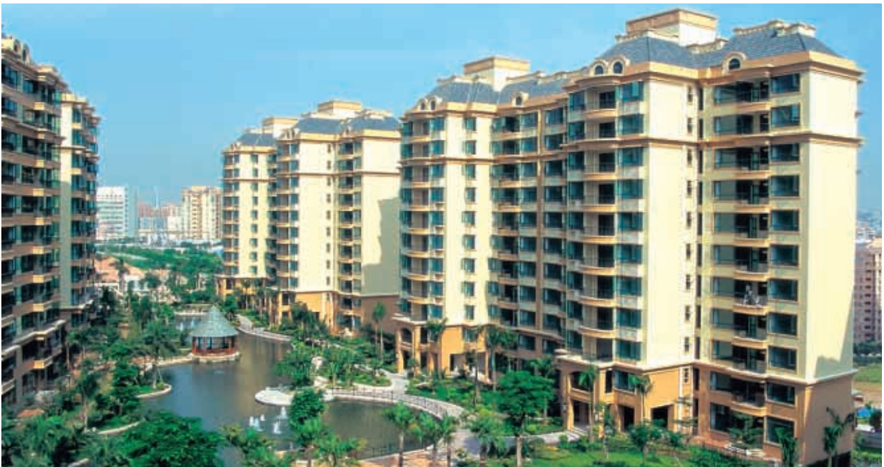
• Star Palace

As of 31 December 2005, there were no properties held for future development at The Landmark. The whole project was completed.