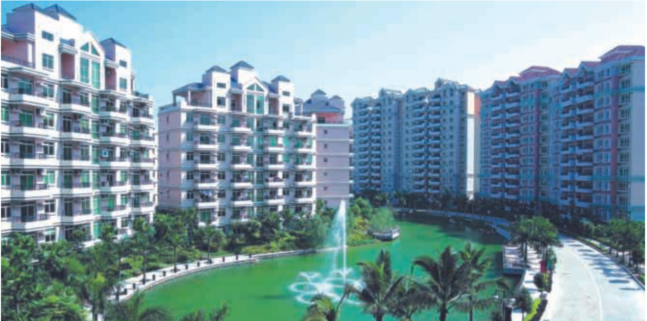
• Majestic Garden