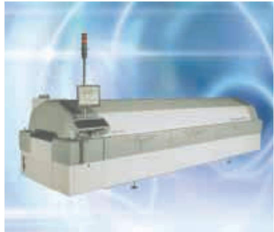
Vitronics Soltec 回流焊爐