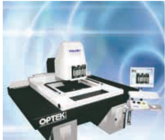
Optical Measuring Machine 光學檢測儀