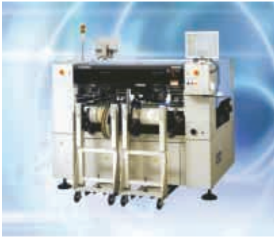
Yamaha YG200 Surface Mounter 高精度，高速度貼片機