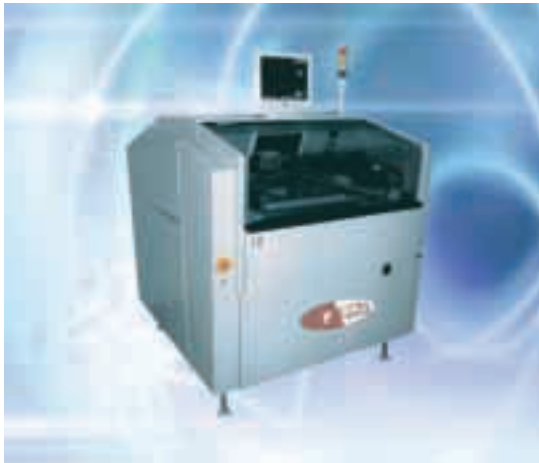
i8 In-Line Printer 錫膏印刷機