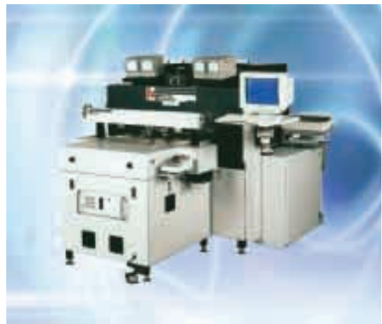
Multilayer Registration System 多層線路板對位系統