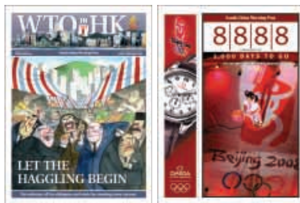
Supplements on the recent WTO meeting in Hong Kong (left) and the countdown to the Beijing 2008 Olympics (right) are among the many special reports that advertisers support over the course of a year

There were a number of highlights over the course of the year. For instance, in second half 2005, the SCMP received awards for its tsunami coverage and for the technical categories of printing and photo reproduction at the Pacific Area Newspaper Publishers Association (PANPA) Newspaper of the Year Awards. PANPA is Asia’s largest industry association, with a membership of nearly 200. The SCMP entered the PANPA awards as a large circulation newspaper (above 50,000 copies).