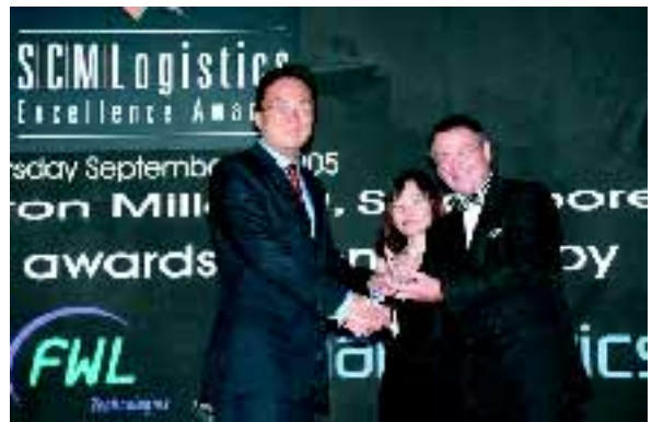
IDS Singapore was awarded the 2005 SCM Logistics Excellence Award for Best Young Asian Integrated Logistics Service Provider.

As a consequence of rising fuel prices, more and more customers are looking for ways to optimize their transportation costs through improved routing and a rationalized depot network. We clearly see the potential of offering sophisticated Transportation and Network Management solutions as another value-added service. Using the latest mapping technology and operations research methodology, we have been commissioned by some of our major customers to conduct studies in China and the Philippines. We are confident that our continuous enhancement of service offerings will further differentiate us from our competitors, thus strengthen our partnerships with customers.