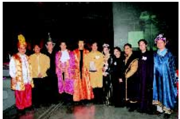
IDS also won the much-coveted Unilever 2004 Vendor of the Year Award in the Philippines.