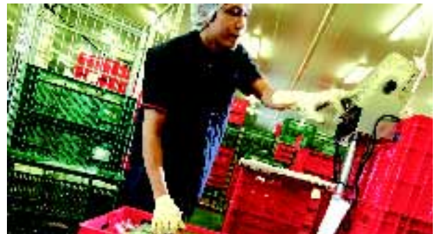
The IDS cold storage facility in Thailand dedicated to the Carrefour operations was opened in May 2005.