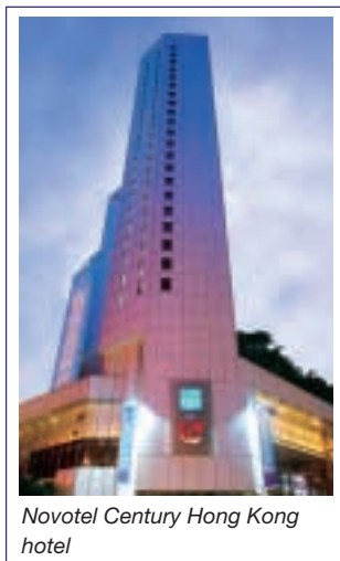
Novotel Century Hong Kong hotel

The Group's investment property portfolio continued to record improving results, benefiting from the buoyant local property market. St. George Apartments, Century Court, Allied Cargo Centre, Park Place, 22nd floor of No. 9 Queen's Road Central and China Online Centre all achieved higher rental income as and when leases were renewed during the year.