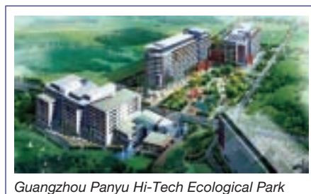
Guangzhou Panyu Hi-Tech Ecological Park

Tian An, a listed associate of Sun Hung Kai and the Group's PRC property unit, registered a 10.2% increase in net profit attributable to its equity holders to HK$202.5 million. The increase in profit for the year is largely the result of an increase in the valuation of Tian An's investment properties. Tian An as a whole registered lower sales of total gross floor area of approximately 138,000 m 2 , as compared to 225,000 m 2 in 2004.