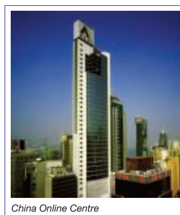
China Online Centre

Contribution from Ibis North Point continued to strengthen during the second half of the year. The hotel operating income almost doubled compared with that of last year due to the rise in the number of rooms and the increased average room rates.