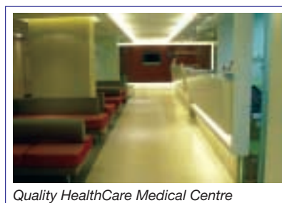
Quality HealthCare Medical Centre

Major resources were dedicated towards renovation and upgrading some of the key medical centres, including the flagship centre at Prince's Building. The purposes of the renovation were to upgrade the facilities, enhance the operational efficiency and improve the ambience of the centres in order to deliver a better experience for clients.