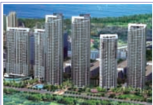
Perspective of Tian An Golf Garden (Phase 3) in Shenzhen Tian An Cyber Park

The decline in sales is the direct result of management's decision to maximise its profit margin from its development properties, and to retain for their rental income selected properties which Tian An believes will provide increasing rental streams with corresponding increases in value.