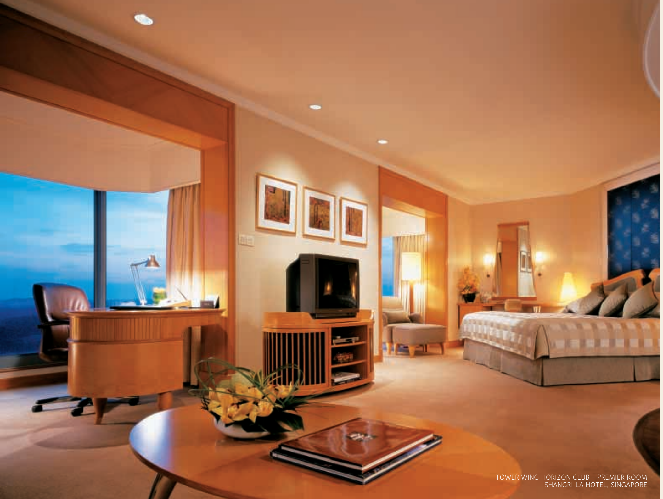
TOWER WING HORIZON CLUB – PREMIER ROOM SHANGRI-LA HOTEL, SINGAPORE