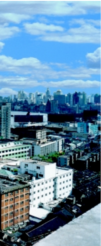
公司總部辦公大樓 Headquarters of the Company