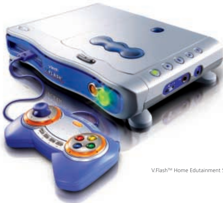
V.Flash™ Home Edutainment System

The record revenue achieved by the CMS business during the financial year 2006 reflects a second successive year of outperformance of the global electronic manufacturing services (EMS) market, which remains in a healthy growth cycle. We retain our focus on small and medium sized customers to which we provide a highly flexible and reliable service that runs from product design to full production.