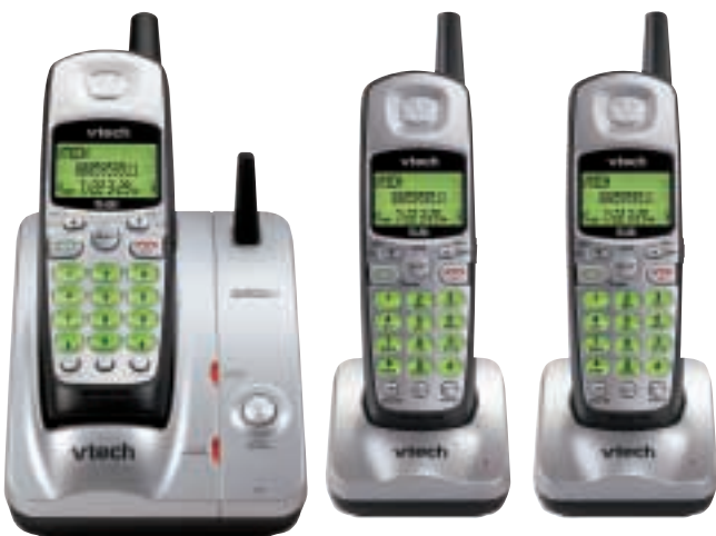
5.8GHz Analog Cordless Phones

Although V.Smile has undoubtedly been the centre of attention since its launch, we are also committed to enhancing our traditional ELPs, which still account for a significant part of the total ELP revenue. As educational toys remains a growing segment in the US toys market, our traditional products give us further opportunities to leverage our strengths in product design and technology adaptation to grow revenue and market share.