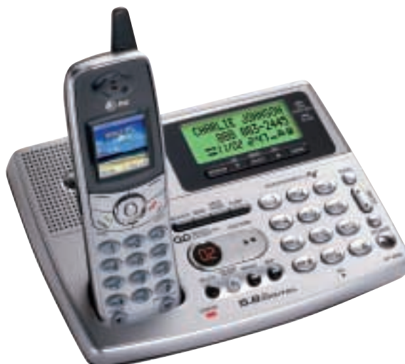
5.8GHz Cordless Answering System