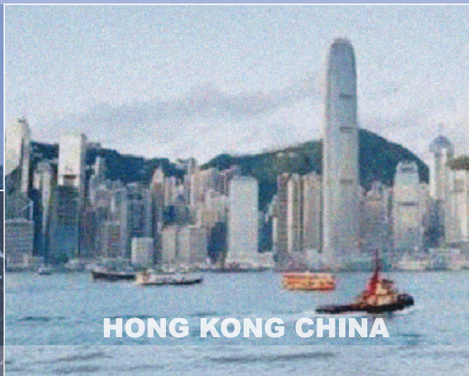
HONG KONG CHINA