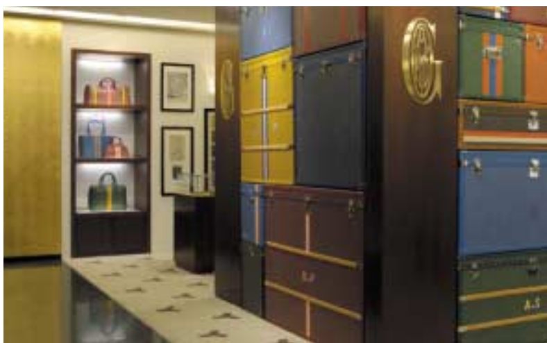
Exclusive Goyard shop-in-shop. 獨家「Goyard」專賣店。