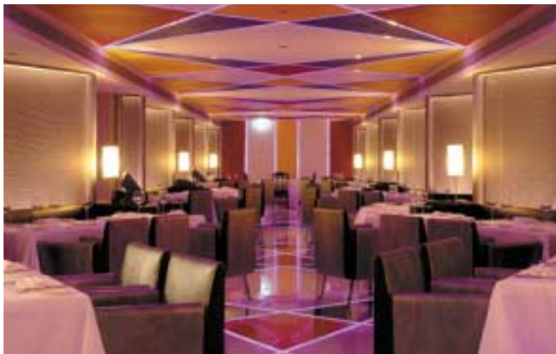
Fourth Floor Restaurant and Bar. 「Fourth Floor」餐廳及酒吧。