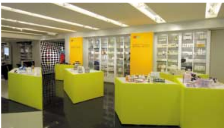
Beyond Beauty department. 「Beyond Beauty」部。