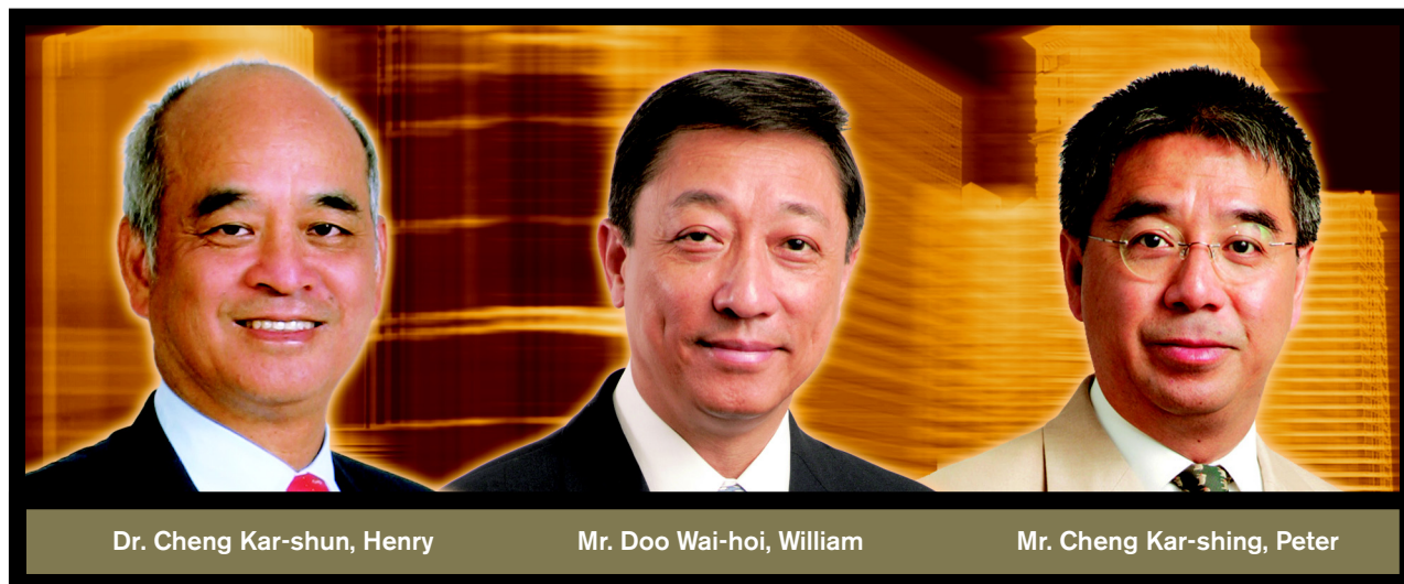
Dr. Cheng Kar-shun, Henry