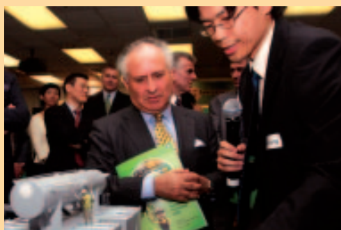
→ (Left) Visiting BCLP Power Station, Thailand → (Right) Being briefed by one of the winners of the Safety Circle Champions Awards