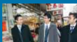
▶▶ 16 Driving performance forward