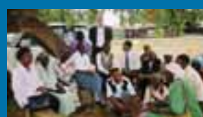
▶▶ 24 Sustainability in action