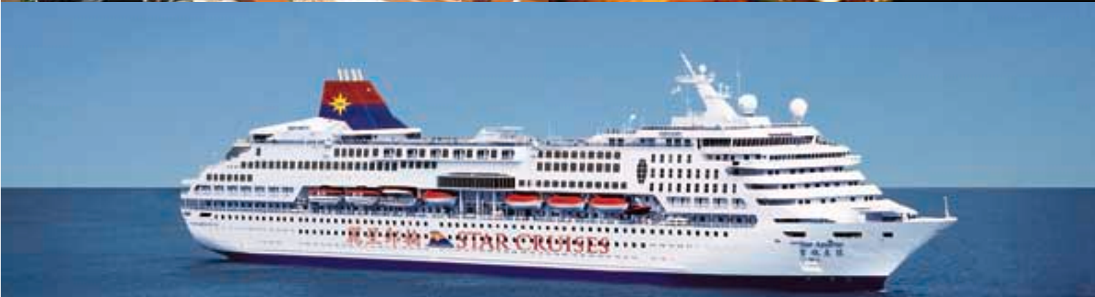
SuperStar Aquarius at sea