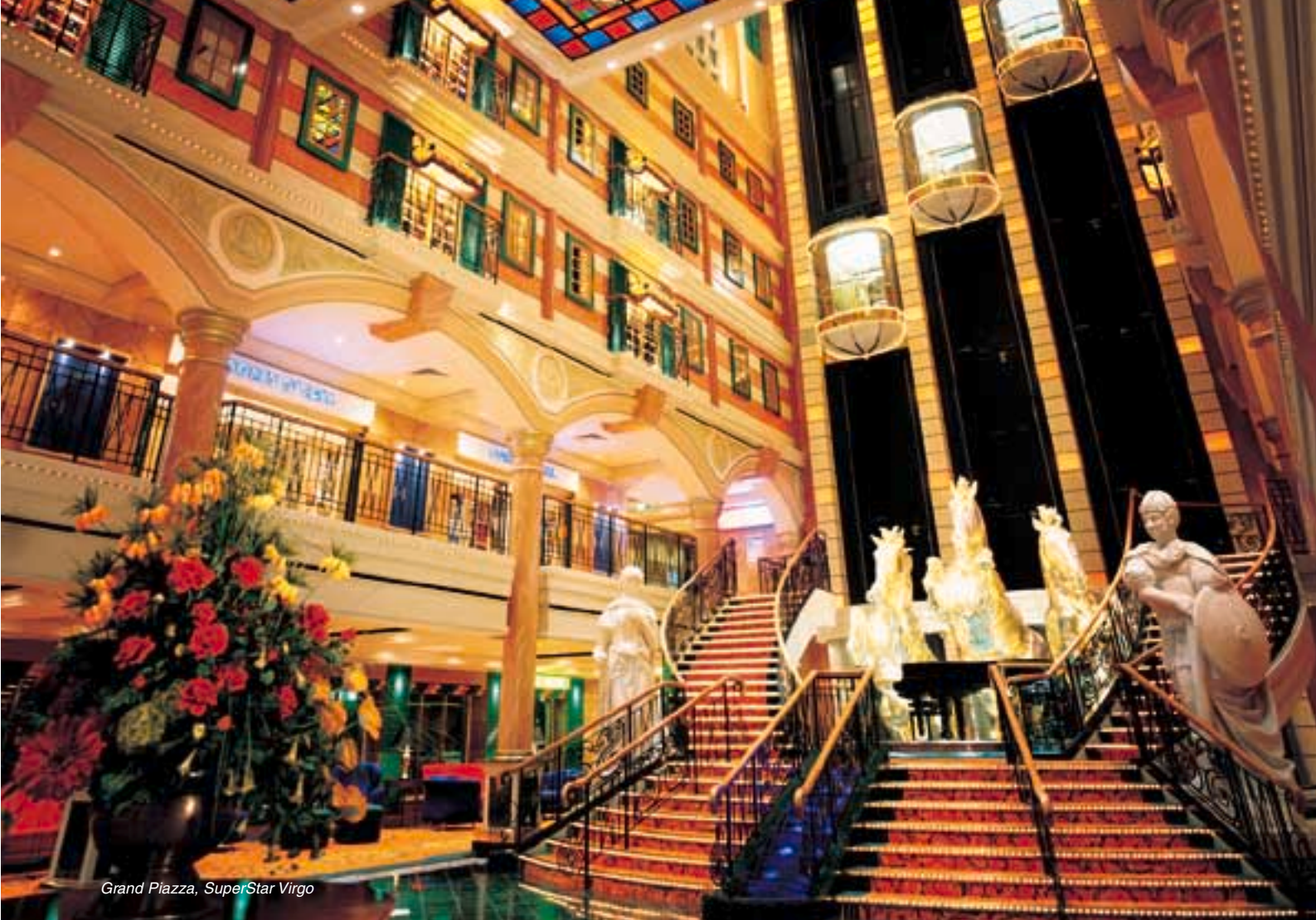
Grand Piazza, SuperStar Virgo