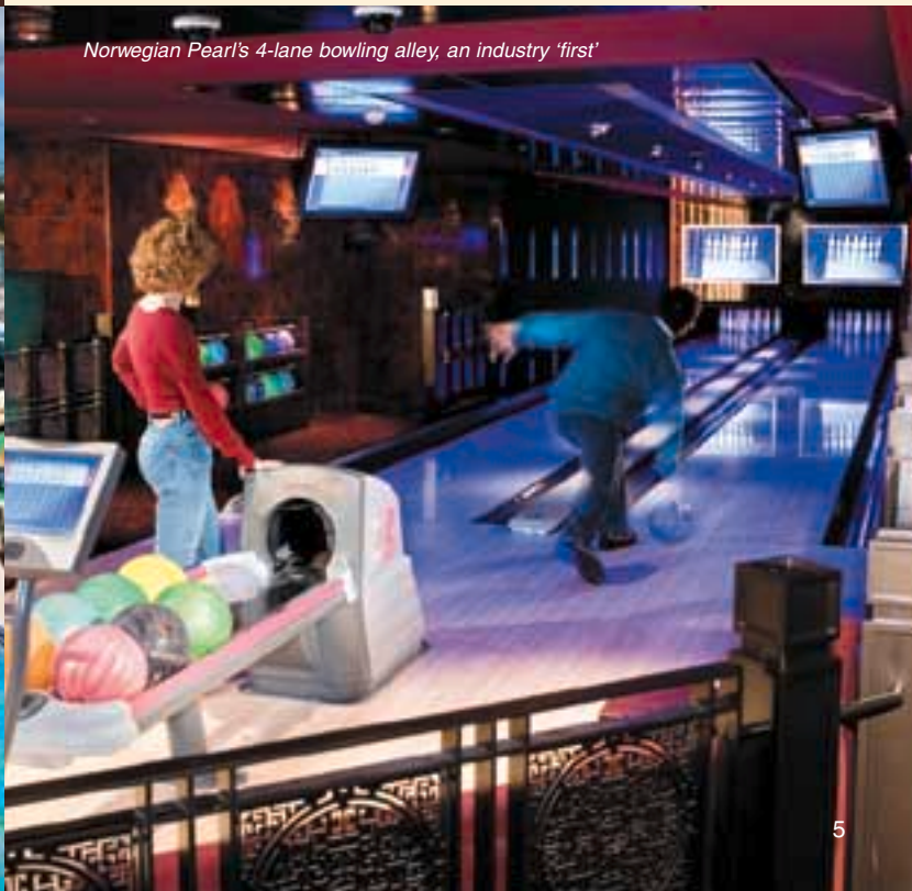
Norwegian Pearl's 4-lane bowling alley, an industry 'first'