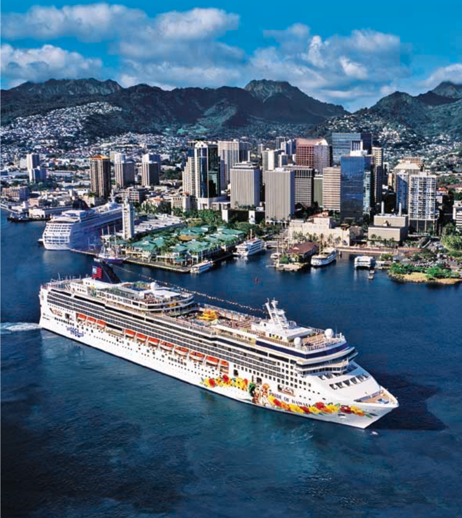
Pride of Hawai'i makes her way along the waters of Honolulu, Hawai'i