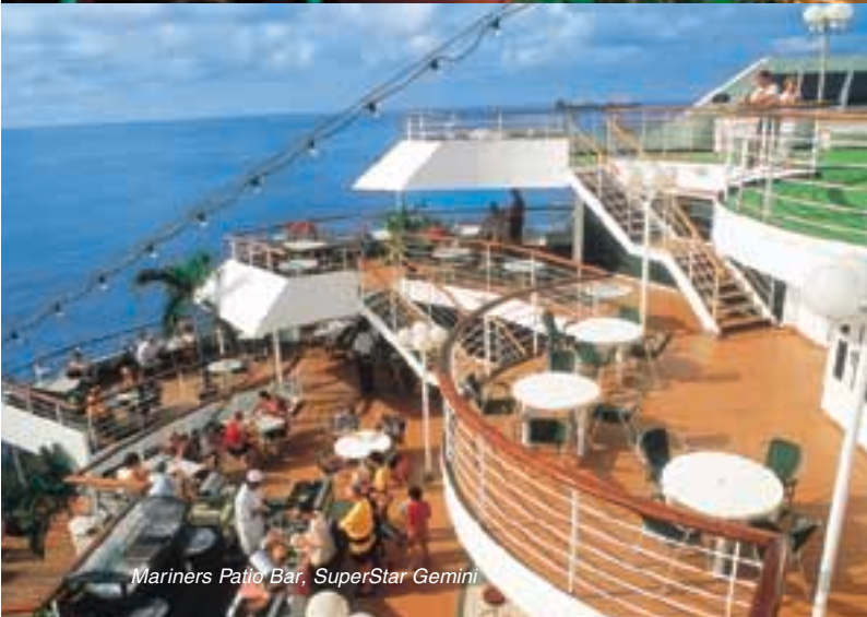
Mariners Patio Bar, SuperStar Gemini