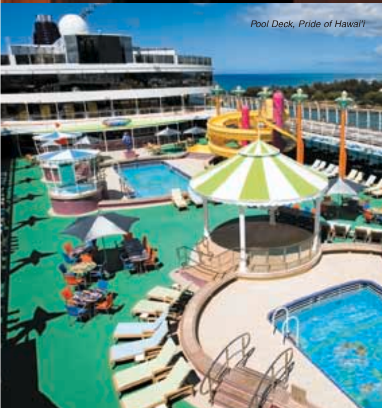
Pool Deck, Pride of Hawai'i

NCL entered into a contract with Aker Yards S.A. of France to build three new cruise ships (including an option) with a tonnage of approximately 150,000 each, scheduled for delivery between 2009 and 2011. The ships represent a new generation of Freestyle Cruising vessels and we will by 2010 see very little of the NCL we bought in 2000 except the name and the people, replaced by the youngest, most innovative and exciting fleet in the industry.