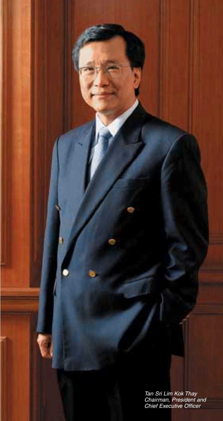
Tan Sri Lim Kok Thay Chairman, President and Chief Executive Officer