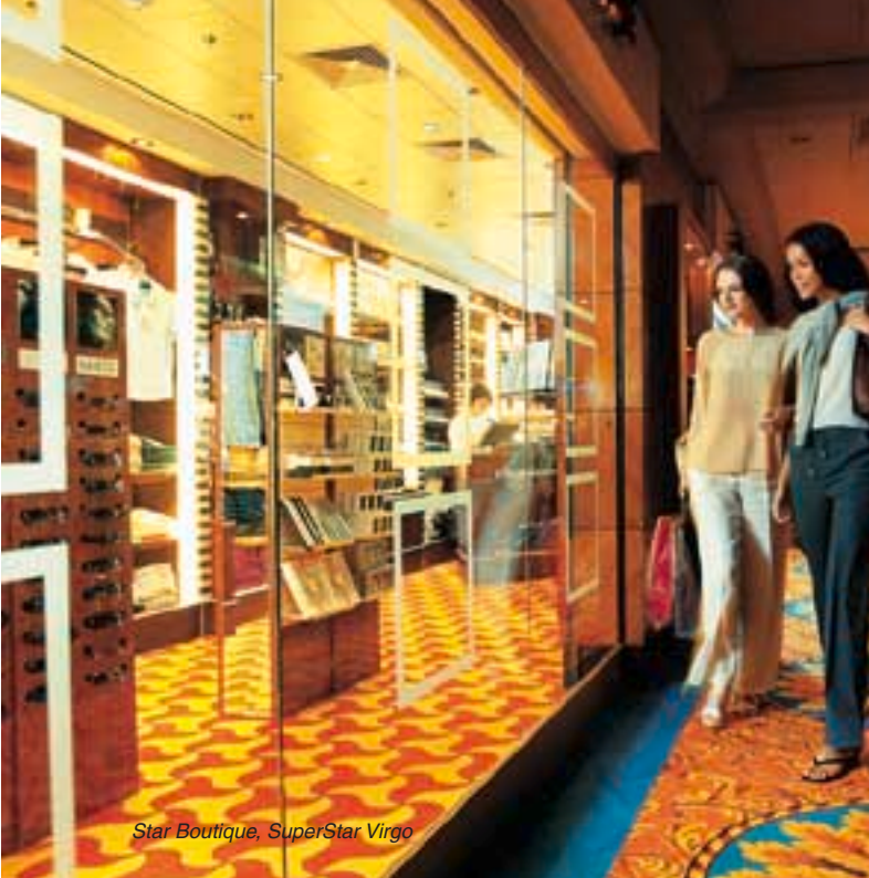
Star Boutique, SuperStar Virgo