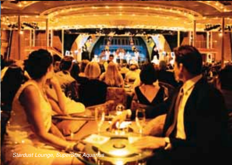
Stardust Lounge, SuperStar Aquarius