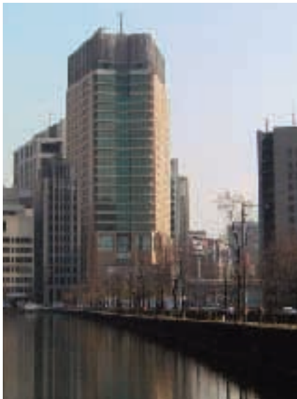
Exterior view of The Peninsula Tokyo

After nearly two years of construction, the building was topped off in June 2006 with the placement of the last construction beam. Work has continued apace on both the exterior and interior of the building.