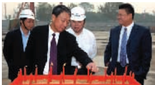
Ground breaking ceremony of The Peninsula Shanghai

92,160 square meters (55,974 square meters above ground and 36,186 square meters below ground) and is located at 32 Zhong Shan Yi Road (East) with direct frontage onto the famous Bund. It will be a 15-storey building encompassing 250 guest rooms, three restaurants, banquet facilities, a spa, shopping arcade and a separate residential tower. The initial estimate of the total project cost for The Peninsula Shanghai Waitan Hotel Company Limited, which is 50% owned by the Company, is US$361 million, including total land price of US$109 million and related development and construction costs. The hotel is targeted for completion in 2009.