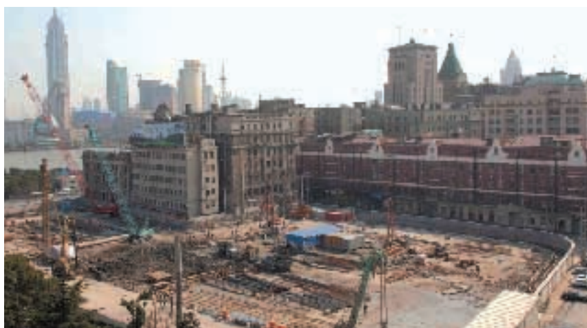
The Peninsula Shanghai's construction site