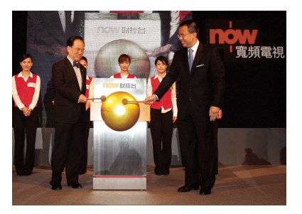
PCCW celebrates launch of the 24-hour NOW Business News Channel.

PCCW's 24-hour NOW Business News Channel launches to deliver up-to-theminute local and international financial news in Cantonese from top journalists and expert analysts. NOW TV also adds a suite of HBO channels on an exclusive Hong Kong broadcast basis, plus the Discovery Channel.