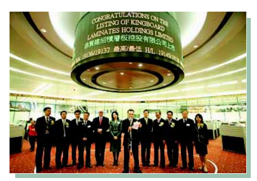
The listing ceremony of Kingboard Laminates Holdings Limited. 建滔積層板控股有限公司之上市儀式。

集團除了成功交出一份亮麗的業績外,更於二零零 六年十二月七日,透過建滔積層板控股有限公司 (「建滔積層板」)將旗下覆銅面板業務分拆,並在香 港聯合交易所有限公司(「聯交所」)主板上市,為集 團的發展歷程奠定另一里程碑。將建滔積層板分拆 上市,除可讓投資者獨立評估及分析集團內各業務 部門之表現及潛力,亦有助集團的覆銅面板業務成 功進入國際資本市場,並捕捉各種進一步增長的機 遇。由於資產負債表的狀況理想,促使集團處於一個 前所未有的有利位置去抓緊印刷線路板及化工部門 進一步增長的商機。