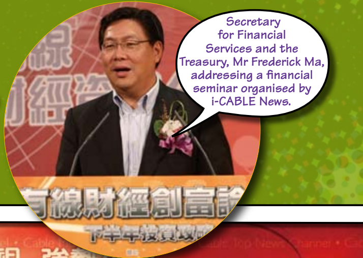
Secretary for Financial Services and the Treasury, Mr Frederick Ma, addressing a financial seminar organised by i-CABLE News.