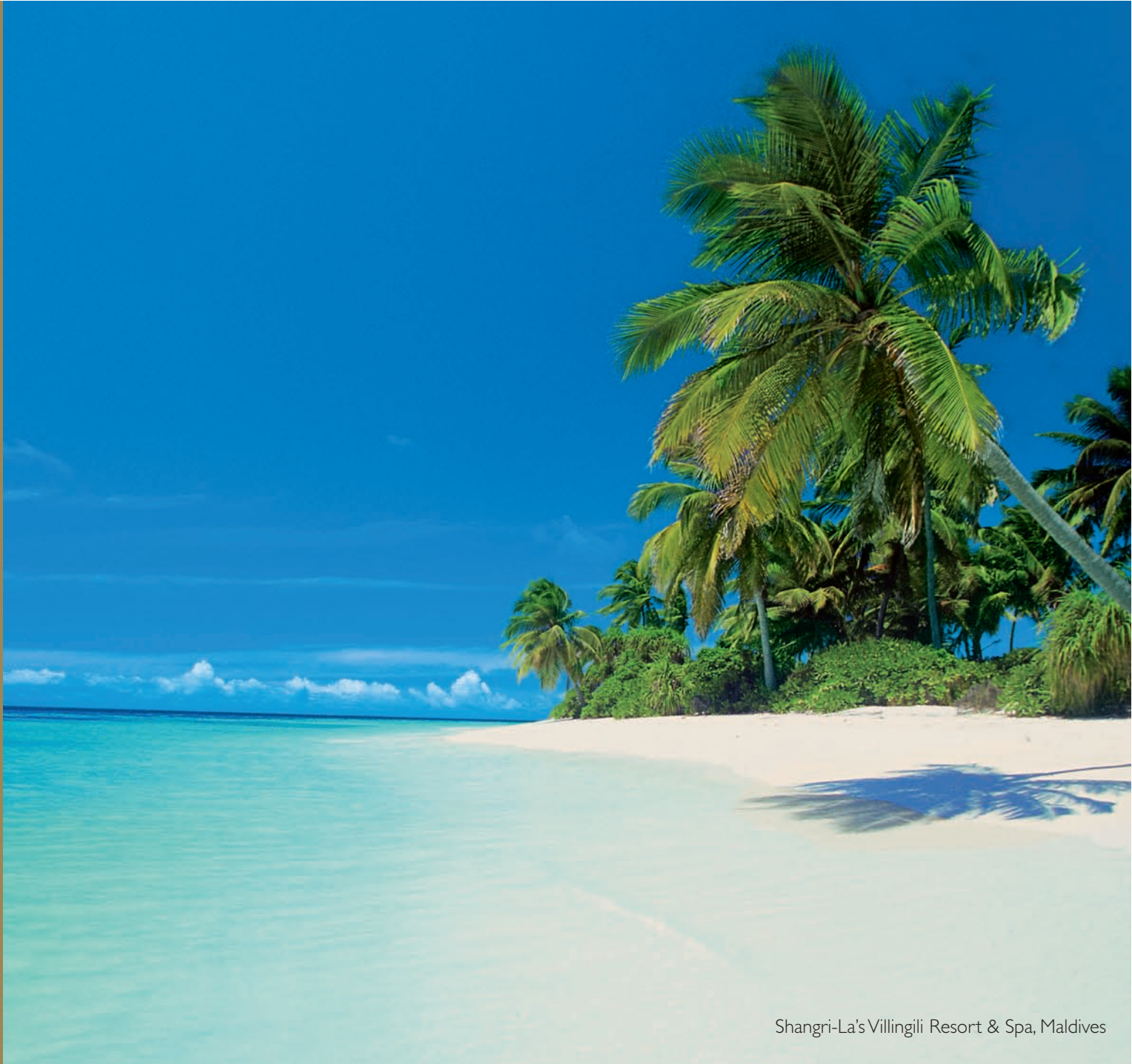
Shangri-La's Villingili Resort & Spa, Maldives