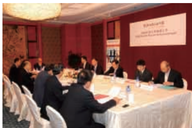
The Board held regular meetings to discuss direction, strategy, performance and control of the Group.