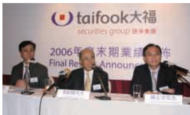
Hosting the 2006 Annual Results Press Conference.

The Company encourages two way communications with both its institutional and private investors. Extensive information about the Company's activities is provided in its Annual Report and Interim Report, which are sent to shareholders of the Company. Press conferences are held on results announcement to explain the Company's activities, performance and future plans and to enable better understanding of the Group by the public.