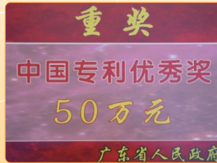
Award plaque recognizing Comba's technical excellence

June: Comba's band selective repeaters recognized for technical excellence by the State Intellectual Property Office of PRC and awarded the Ninth Session National Outstanding Patent Award.