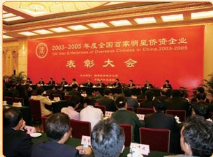
Award presentation ceremony held in Beijing

September: Comba recognized as one of the “Top 100 National & Overseas Chinese Enterprises between 2003 to 2005” by the Overseas Chinese Affairs Office of the PRC State Council.