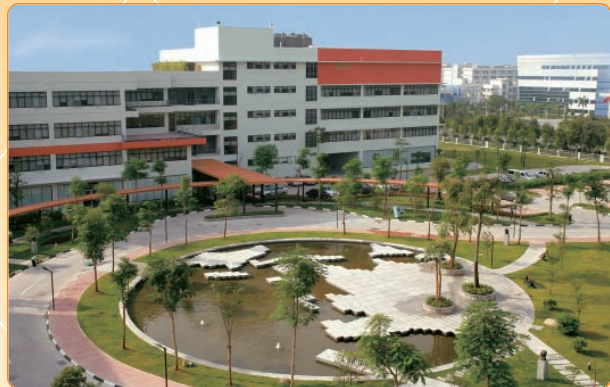
Aerial view of Comba's facilities at Guangzhou Science City

September: Inauguration of Comba's new PRC headquarters in Science City, Guangzhou and expansion of production base. Featuring world-class R&D facilities, the new headquarters forms a strong foundation for Comba's growth.