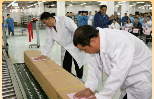
Celebrating the completion of the landmark antenna

December: Comba's annual production of BTS antennas reaches 100,000 for the first time.