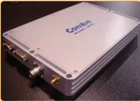
The 3G MCPA was developed by Comba's R&D facilities in Santa Clara, California

April: Launch of the 3G MCPA (multi-carrier power amplifier) at the CTIA Wireless 2006 conference in Las Vegas.