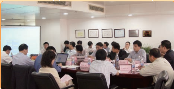
Realignment of business units will create synergies and efficiencies

April: Comba realigns its business units to effectively address the Company's future development. Three units were established: Wireless Enhancement, Antennas & Subsystems and Wireless Transmission.