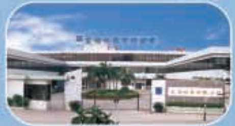
Panyu - China