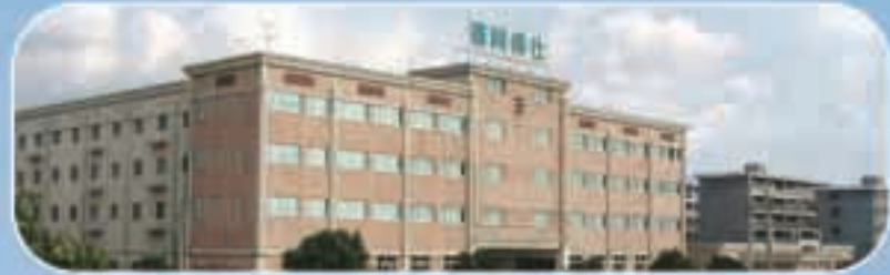
Hangzhou - China