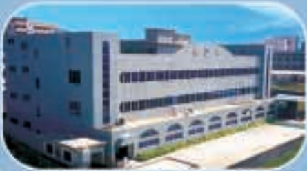
Shenzhen - China