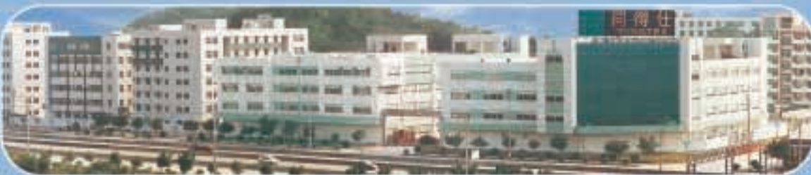
Zhongshan - China