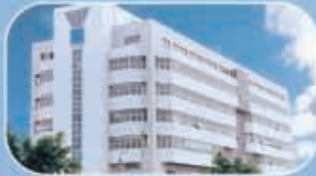
Shenzhen - China