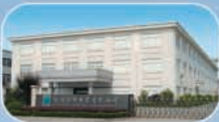
Hangzhou - China