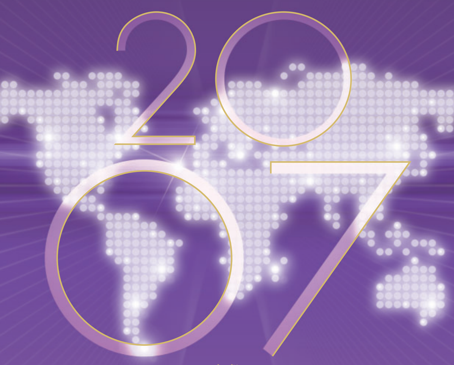
年報 Annual Report