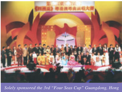
Kong and Macau Cantonese Opera Contest