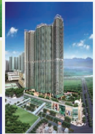
The Grandiose ▶