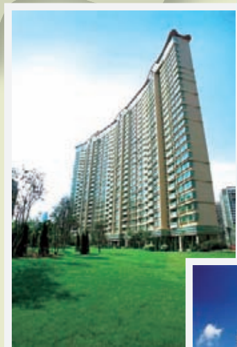
◀ Parc Palais