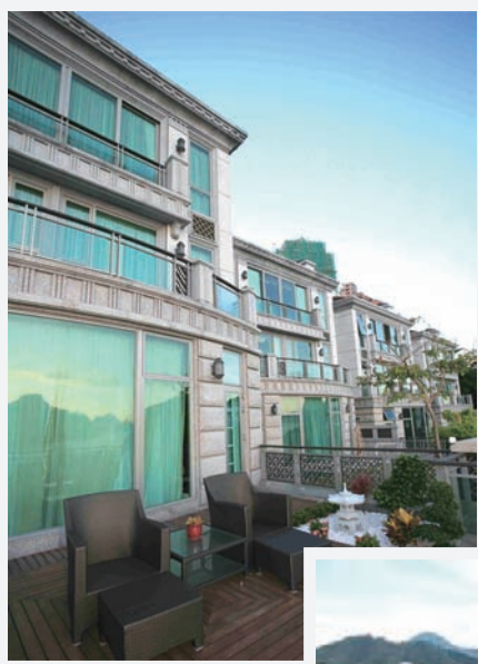
◀ 33 Island Road

Major Property Development Projects in Hong Kong