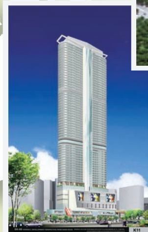
Hanoi Road ◀ Redevelopment Project