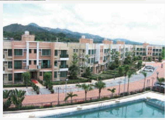
▲ Deep Bay Grove