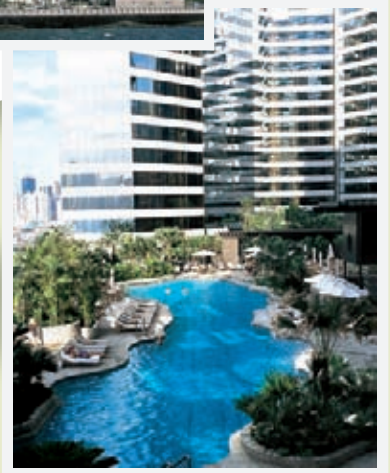
Renaissance Harbour View Hotel ▶