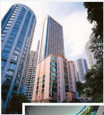
◀ 2 MacDonnell Road