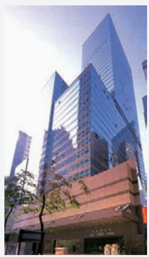
▲ New World Tower