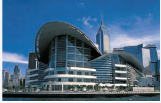
▲ Hong Kong Convention and Exhibition Centre