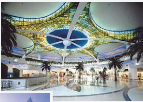
▲ Discovery Park Shopping Mall