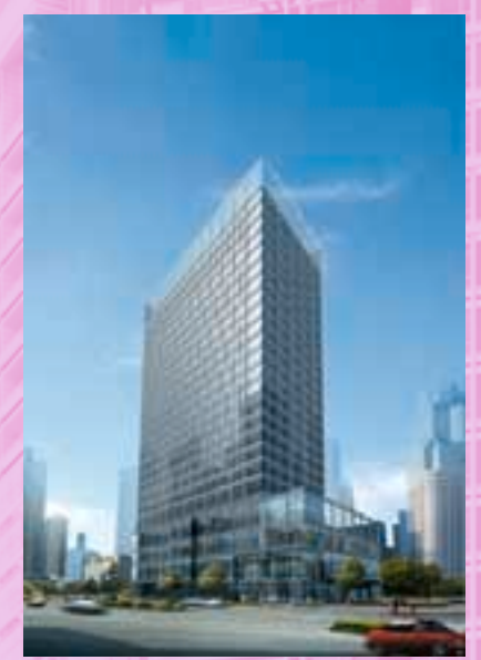
Shanghai Northgate Plaza Phase II (architectual rendering)