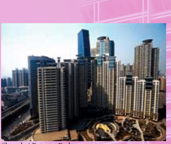
Shanghai Regents Park