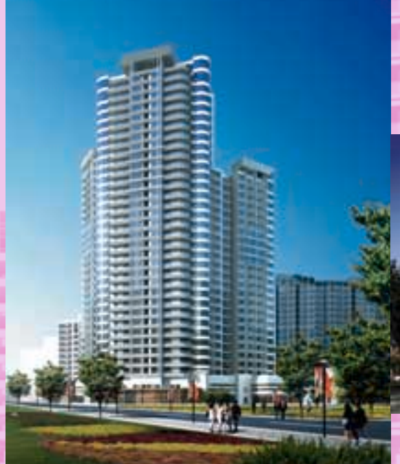
Shanghai May Flower Plaza (architectual rendering)