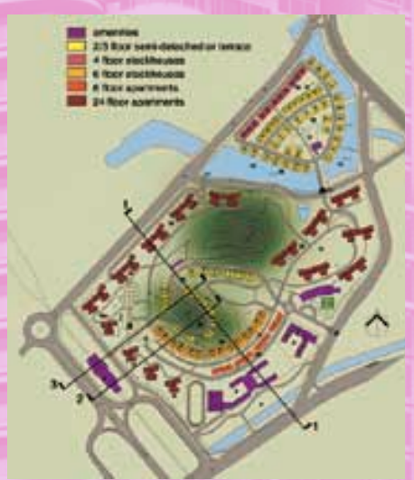
Guangzhou Jinshazhou Project