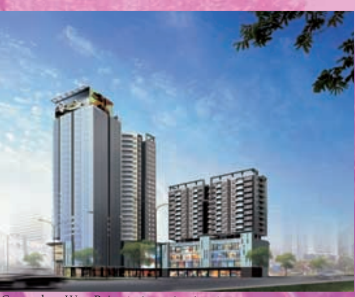
Guangzhou West Point (architectual rendering)