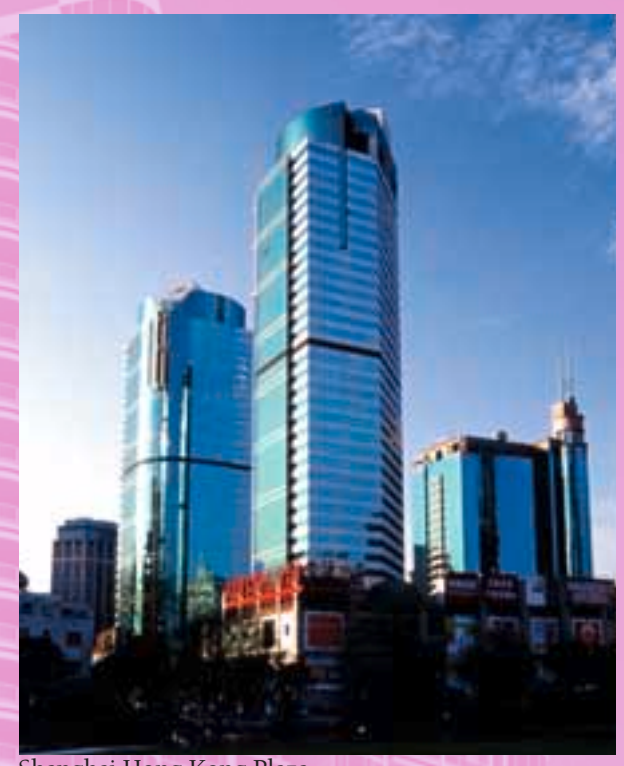
Shanghai Hong Kong Plaza