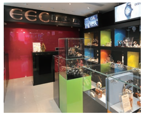
EEC TimeZone, Hong Kong

Mechanical movements are a key component of high-end watches and have been in short supply on a global basis. Peace Mark plans to strengthen its mechanical watch movements manufacturing capability. In addition to Shanghai Golden Time Precision which produces approximate 50,000 pieces a year, Peace Mark entered into a preliminary agreement to acquire 51% of Tianjin Seagull Watch Company's movements factory. Capital injection of the transaction was completed in October 2007 and therefore no contribution was reported from the factory for the period. This Tianjin watch movements facility has a capacity of producing 6,000,000 pieces a year and currently the annual output is approximately 4,000,000 pieces. Together with the movements factory in Shanghai, Peace Mark has become the leader in the China mechanical watch movements market with a market share in mechanical movements manufacturing of approximately 40% and possesses superb manufacturing technology capable of producing various complications.