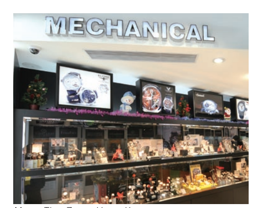
Mega TimeZone, Hong Kong