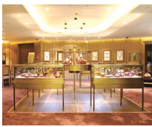
Boucheron bontique, Shanghai