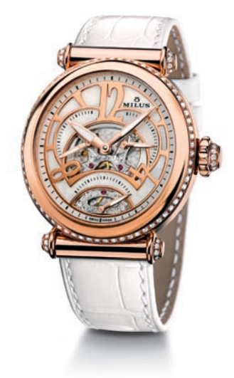
Milus "MEREA TriRetrograde Seconds Skeleton"