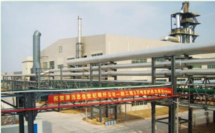
The new glass yarn plant in Qingyuan, Guangdong province further enhances our vertical integration development.

於二零零七年十二月三十一日，集團合共聘用員工超過8,600人(二零零六年十二月三十一日：7,200人)，員工人數增加乃為配合集團業務擴展之步伐。集團除了提供具競爭力的薪酬待遇之外，亦會根據公司的整體財政狀況和個別員工的表現，發放特別獎金予合資格員工。