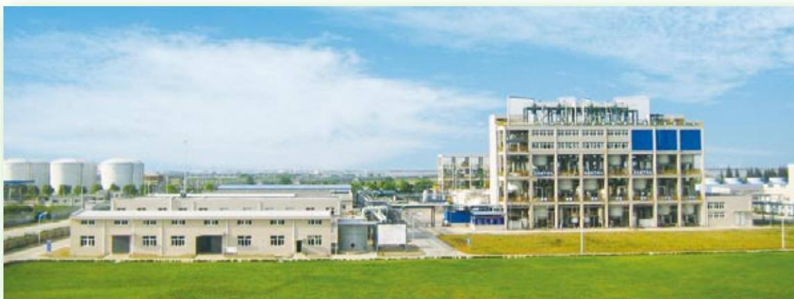
Our new epoxy resin plant in Jiangyin, Jiangsu province bolsters our production capacities of upstream materials. 位於江蘇省江陰之新環氧樹脂廠，進一步提升集團上游物料的產能。

分銷成本隨著產品付運量上升而增加15%。行政開支僅上升13%，增幅較營業額之增長率為低，反映營運效率有所改善。財務費用為一億六千八百一十萬港元，主要來自二零零六年十二月提取的二十五億港元之五年期貸款之利息開支，以及因營運資金所需而提取之信託票據貸款之利息開支。