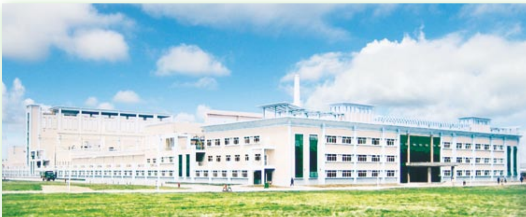
The new glass epoxy laminate plant in Jiangyin, Jiangsu province reinforces our presence in eastern China. 位於江蘇省江陰之新環氧玻璃纖維覆銅面板廠，強化集團在華東地區的市場地位。

集團在江蘇省江陰新設的環氧玻璃纖維覆銅面板廠已於二零零七年四月開始投產，至二零零七年年底，每月產能已達六十萬張。於二零零七年，集團亦將位於廣東省佛岡之環氧玻璃纖維覆銅面板生產設施的每月產能提升四十萬張。經過此等產能擴充，集團的環氧玻璃纖維覆銅面板的每月產能較去年合共增加一百萬張。擴展計劃充份配合集團銳意強化在華南及華東地區印刷線路板生產基地的市場定位策略，以便為客戶提供優質及依時付運的覆銅面板產品。上游物料如銅箔、漂白木漿紙及環氧樹脂等產能亦在年內作出相應的提升，以增強集團的垂直整合水平。