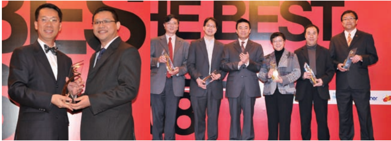
Hi-Tech Weekly The Best of the Best Awards Presentation Ceremony - 3rd April 2008