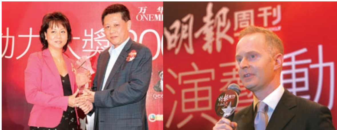
Ming Pao Weekly Showbiz Awards Presentation - 15th November 2007