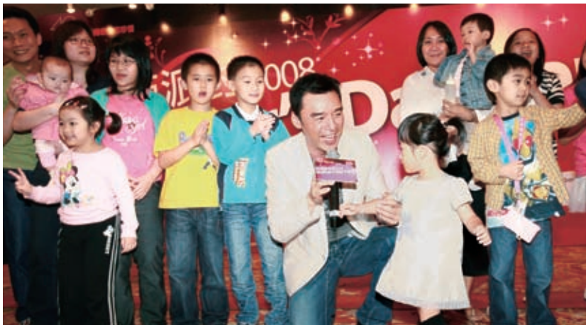
Ming Pao Weekly Mother's Day Party - 11th May 2008