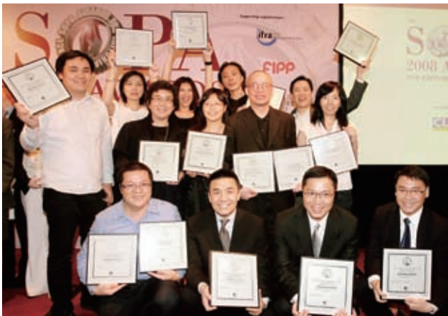
2008 SOPA Awards Presentation - 4th June 2008