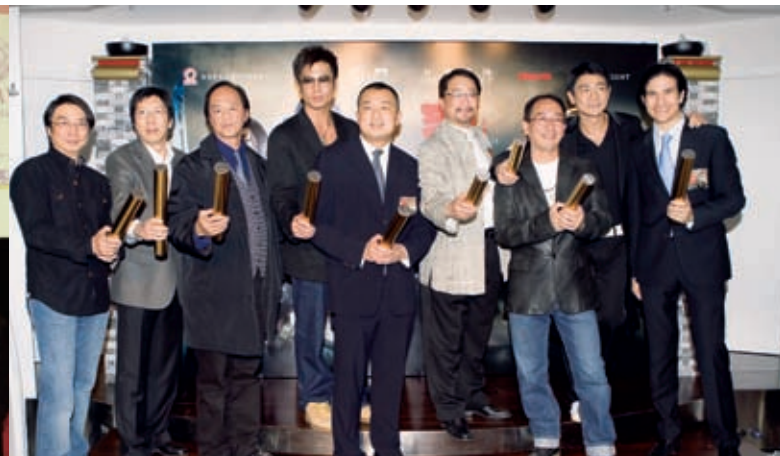
Ming Pao Weekly 40th Anniversary - Three Kingdoms Resurrection of the Dragon Gala Premiere - 26th March 2008