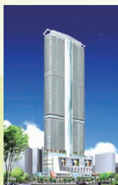
Hanoi Road Redevelopment Project