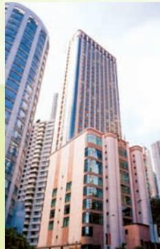
2 MacDonnell Road