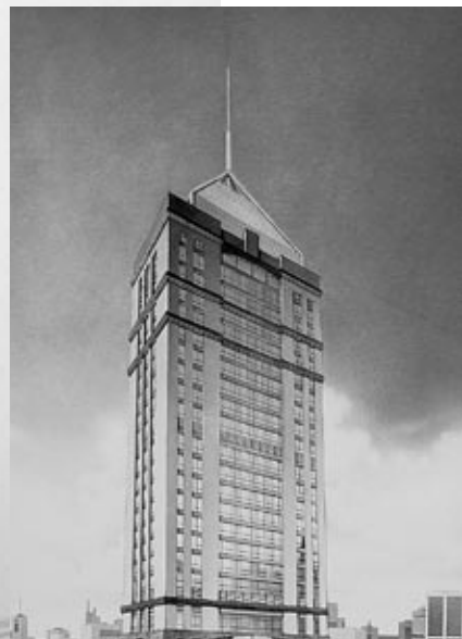
An elevation design of the building. 擴初設計大樓外貌。