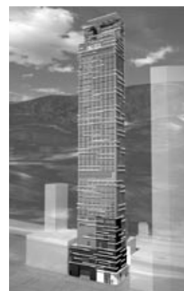
214 Rooms of Hotel Development Project Queen's Road West