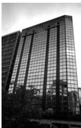
Kowloon Ramada Hotel