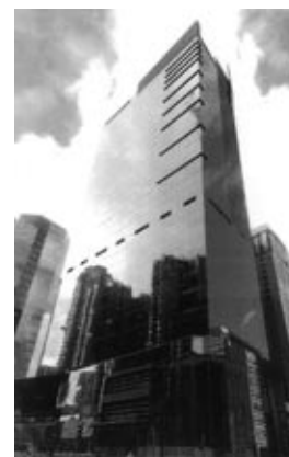
North Point 633 King's Road