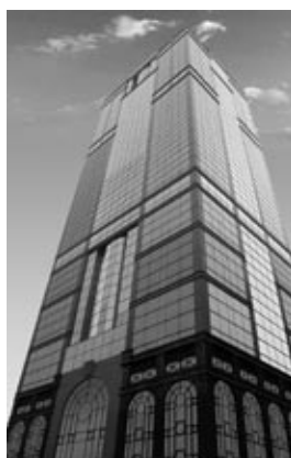
Hong Kong Ramada Hotel