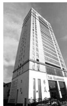
Shanghai Magnificent International Hotel