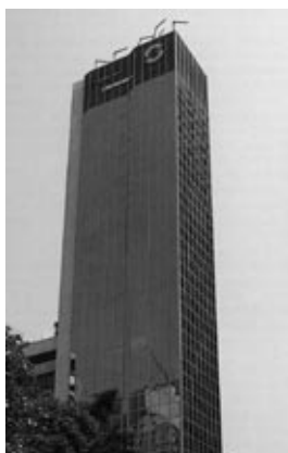
Central Shun Ho Tower