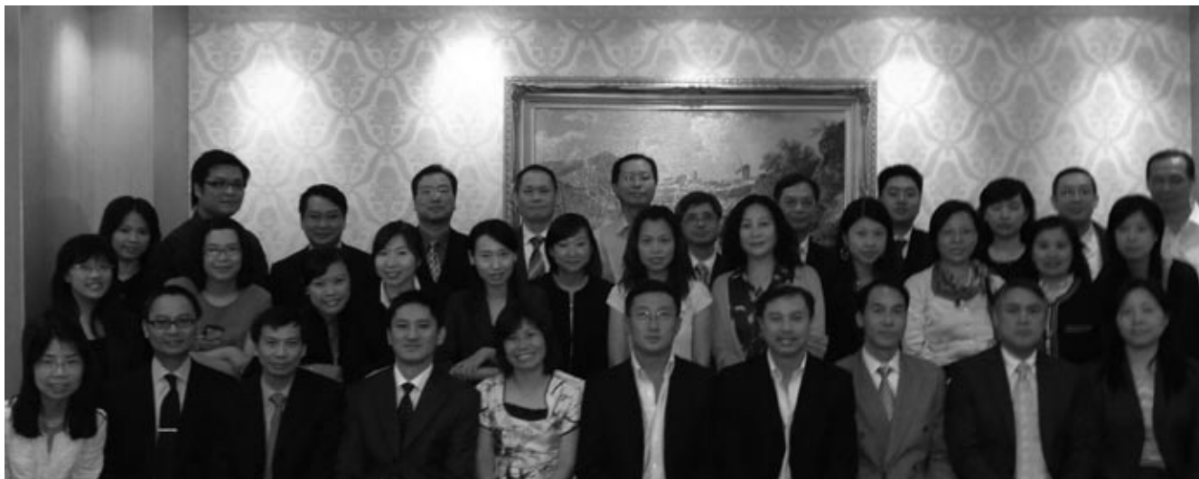
Daily Management Team of Financial Control, Property Managements, Hotel Operations and Developments

I present to the shareholders my report on the results and operations of Magnificent Estates Limited (the "Company") and its subsidiaries (together the "Group") for the year ended 31st December, 2008.