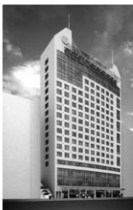
300 Hotel Rooms of Hotel Development Project Austin Avenue