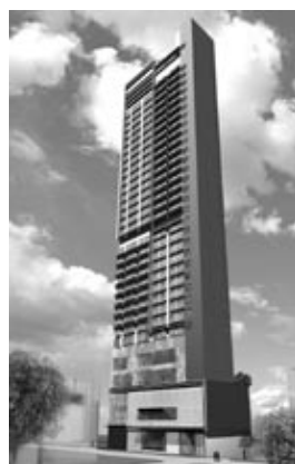
435 Hotel Rooms of Hotel Development Project Queen's Road West