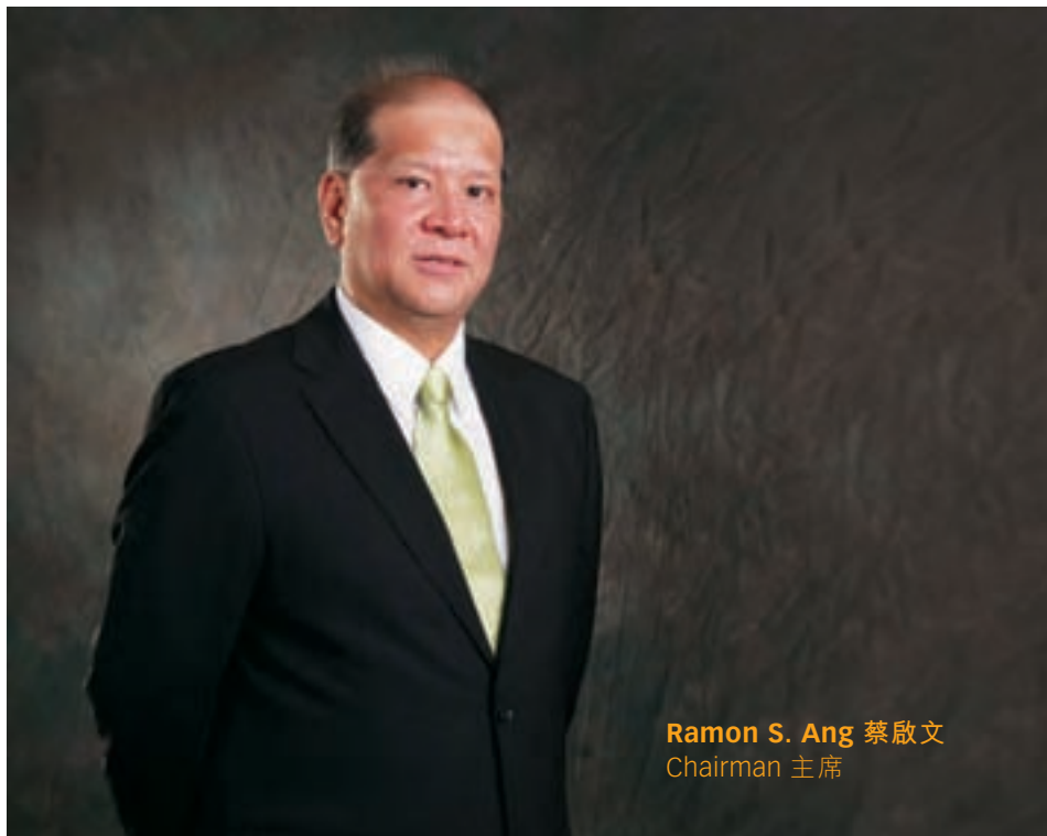
Ramon S. Ang 蔡啟文 Chairman 主席