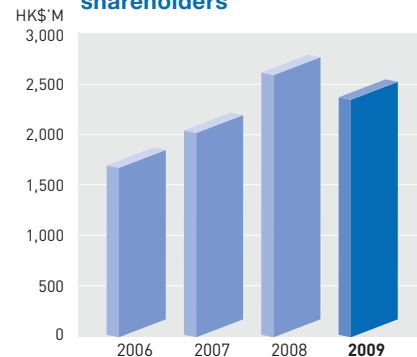
Equity attributable to shareholders

investment portfolio increased by 13%, mainly the result of increased unit rent upon tenancy renewal.