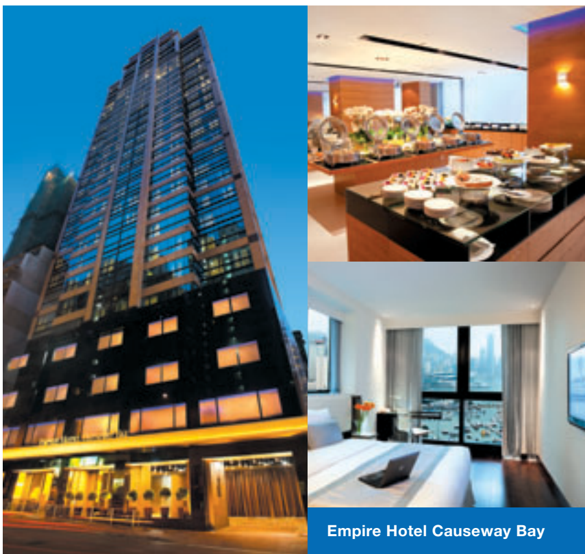
Empire Hotel Causeway Bay