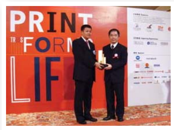
企業社會責任金獎 2008 香港印製大獎