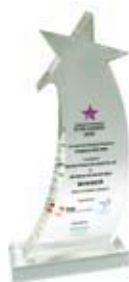
新加坡包裝設計星獎 2008 新加坡包裝協會及 新加坡工業總會