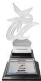
亞洲包裝設計星獎 2008 亞洲包裝聯合會