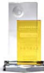
全場印制金獎 2008 “太陽杯” 標籤印制大獎