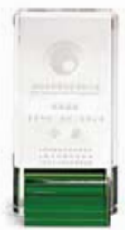
化妝品類金獎 2008 “太陽杯” 標籤印制大獎