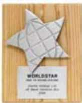
世界包裝設計星獎 2008 世界包裝組織